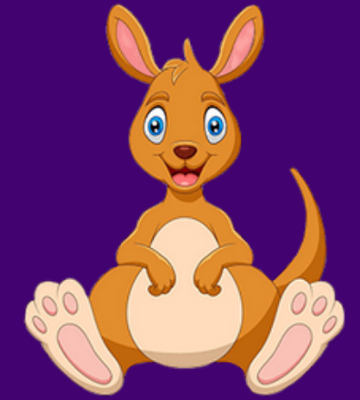
KANGAROO Token Distribution